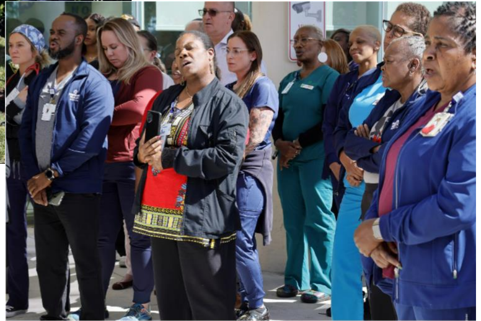
Above: Hospital personnel sing an impromptu rendition of "Amazing Grace" for the victims of the 2018 Marjory Stoneman Douglas High School massacre during a remembrance ceremony Tuesday outside the Emergency Department at Broward Health North in Deerfield Beach. Many of those who attended the gathering had treated shooting victims.